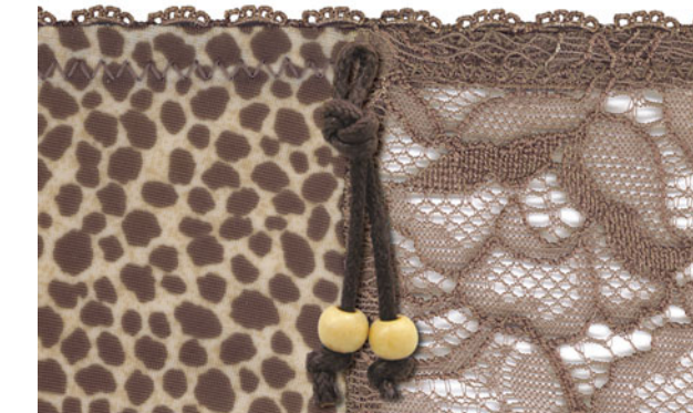
(5)(6) Chocolate Animal Print On Paper Touch Microfibre With Lace : 82% Polyamide 18% Elastane