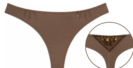
(4) Microfibre Guipure String 6802152