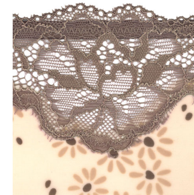
(1)(2) Nude Floral Print On Paper Touch Microfibre With Lace : 77% Polyamide 23% Elastane