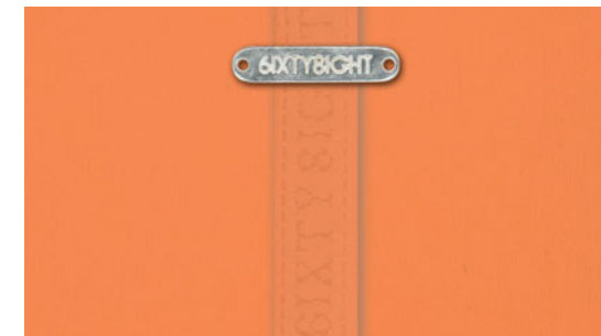
Rust Microfibre : 80% Polyamide 20% Elastane