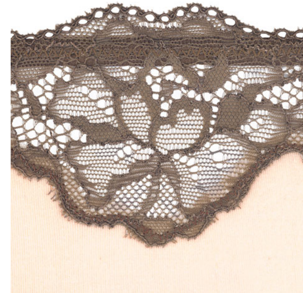
(13)(14) Nude Cotton Modal With Lace : 63% Modal 28% Polyamide 9% Elastane