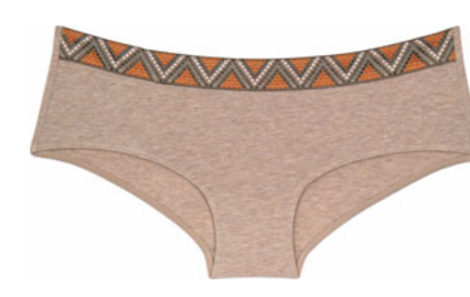
(10) Melange Hipster 6802204