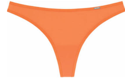
Rust String 6802213