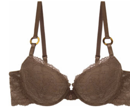
(11) Chocolate Lace T-Shirt Bra 6802159