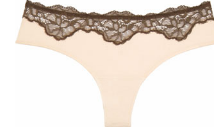
(14) Modal Lace Hipster String 6802162