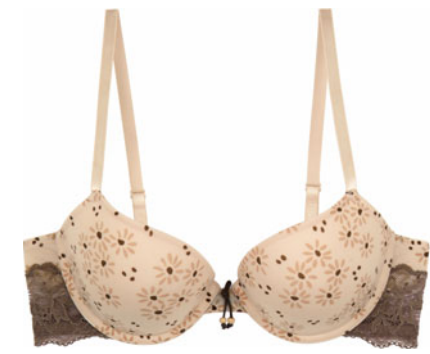
(1) Floral T-Shirt Bra 6802157