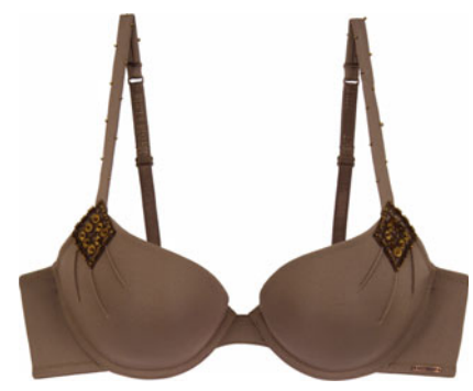
(3) Microfibre Guipure T-Shirt Bra 6802149