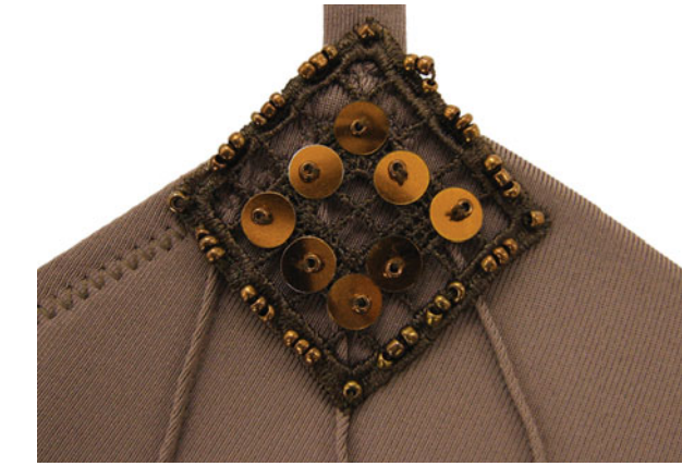
(3)(4) Chocolate Microfibre With Guipure, Sequins & Beading : 92% Polyamide 8% Elastane