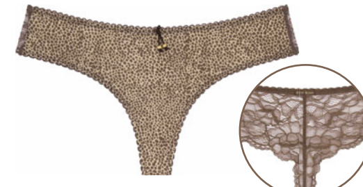
(6) Animal Print Hipster String 6802154