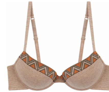
(9) Melange Push Up Bra 6802202