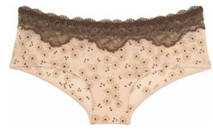
(2) Floral Hipster 6802158