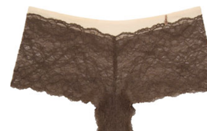
(12) Chocolate Lace Hipster 6802160