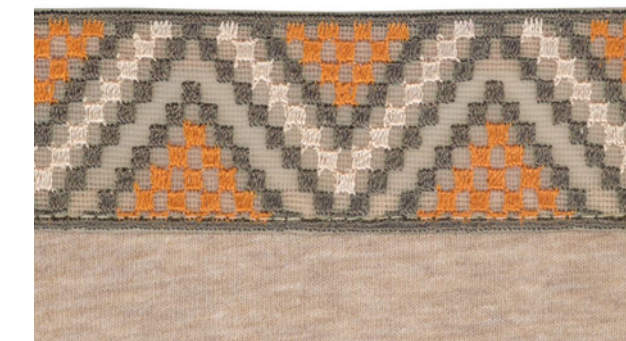
(9)(10) Oatmeal Cotton Melange With Embroidered Trim : 95% Cotton 5% Elastane