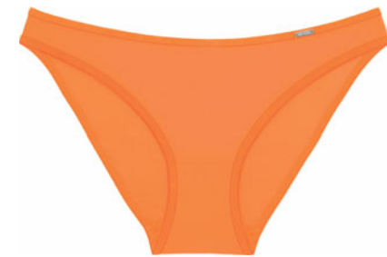
Rust Brief 6802212