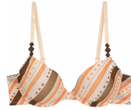
(7) Stripe Moulded Wire Bra 6802155