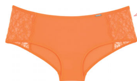
Rust Hipster 6802211