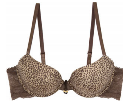
(5) Animal Print T-Shirt Bra 6802153