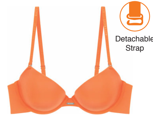
Rust T-Shirt Bra 6802209