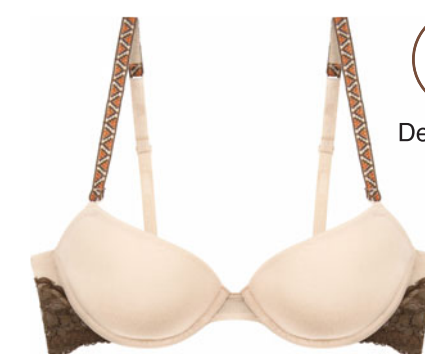
(13) Modal Lace T-Shirt Bra 6802161