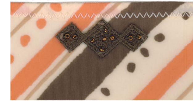
(7)(8) Nude Stripe Print On Paper Touch Microfibre With Guipure : 72% Polyamide 28% Elastane