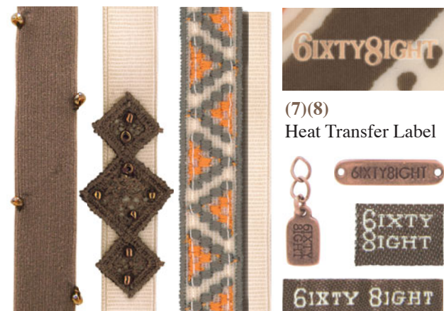
(3) Fancy Straps (7) (13) 2 Straps (Emb.+Solid) 68 Signature