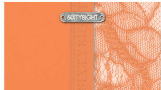
Rust Microfibre With Lace : 84% Polyamide 16% Elastane