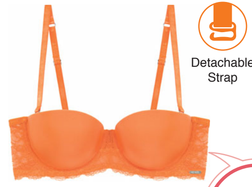
Rust Bandeau Bra 6802210