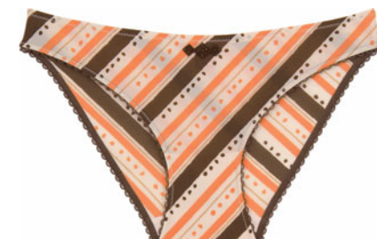
(8) Stripe Brief 6802156